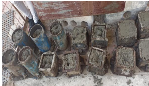
Fig. (2) Tested concrete containing recycled aggregates