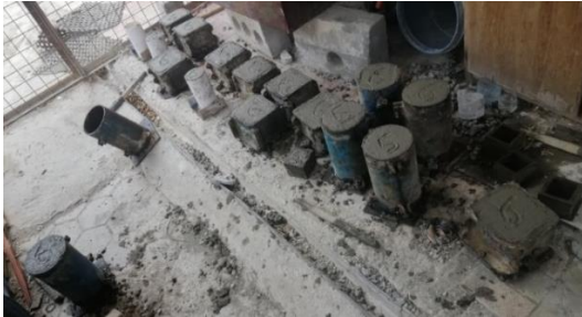
Fig. (1) Tested concrete containing mineral admixtures