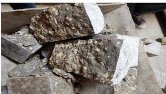
Fig. (5) Failure in S.F 10%