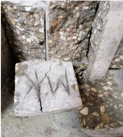
Fig. (8): Failure shape of specimen M.K 20%