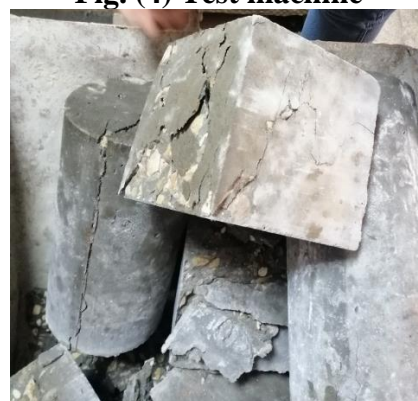
Fig. (6): Failure shape of specimen F.A 15%