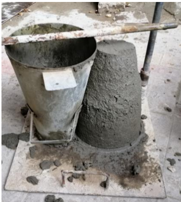
Fig. (3) Slump test for fresh concrete