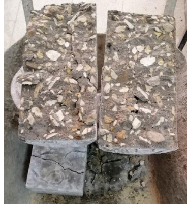
Fig. (7): Failure shape of specimen M.K 10%