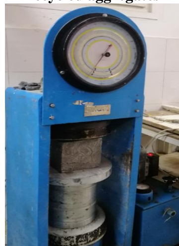
Fig. (4) Test machine