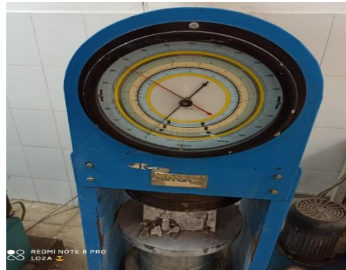
Fig. (9): Failure shape of specimen with recycled concrete